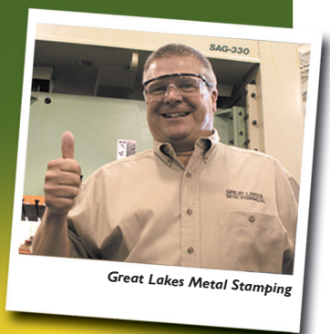
Great Lakes Metal Stamping

"SEYI's up-front analysis work showed us how we'd be more effective on tighter tolerance stamping work...and their gap frames and straight sides have excelled in our high production environment ever since."